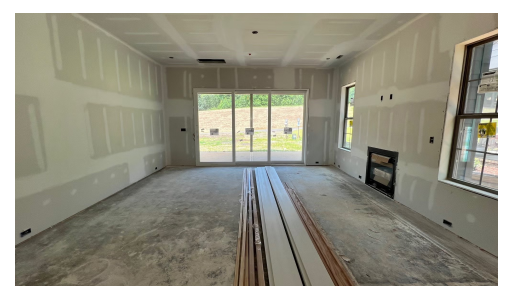
Construction Update: June 2025