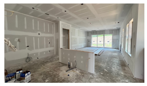
Construction Update: June 2025