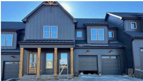
Construction Update - February 2026

Spanning two stories, this townhome embodies contemporary living with an open-concept design that seamlessly connects the family room, kitchen, and dining area. The spacious screened porch off the back of the home invites natural light and offers a delightful extension of the living space. The first floor is dedicated to comfort and luxury, featuring the owner's suite with a spacious walk-in closet, double vanities, and a standing fully tiled shower. Additional highlights on the first floor include a formal dining room, a laundry room, mudroom, and a powder room, ensuring both practicality and style. The second floor unveils a versatile rec room, a powder room for added convenience, two additional bedrooms, and a shared full bathroom. Ample storage is provided with a walk-in attic, and the townhome is complemented by an attached two-car garage.