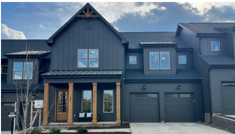
Construction Update: March 2026

Spanning two stories, this townhome embodies contemporary living with an open-concept design that seamlessly connects the family room, kitchen, and dining area. The spacious screened porch off the back of the home invites natural light and offers a delightful extension of the living space. The first floor is dedicated to comfort and luxury, featuring the owner's suite with a spacious walk-in closet, double vanities, and a standing fully tiled shower. Additional highlights on the first floor include a formal dining room, a laundry room, mudroom, and a powder room, ensuring both practicality and style. The second floor unveils a versatile rec room, a powder room for added convenience, two additional bedrooms, and a shared full bathroom. Ample storage is provided with a walk-in attic, and the townhome is complemented by an attached two-car garage.