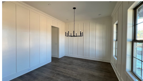
Construction Update - February 2026