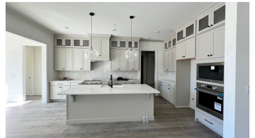
Construction Update - February 2026