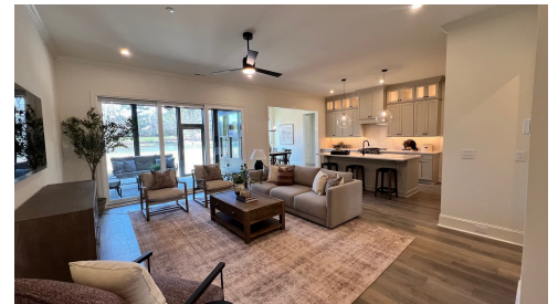
Construction Update: March 2026