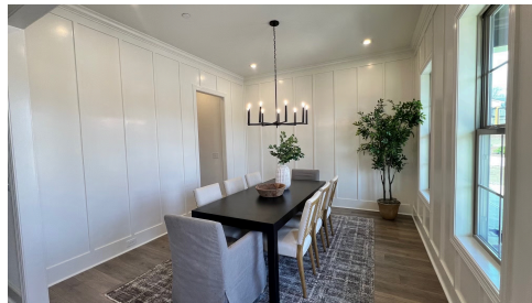
Construction Update: March 2026