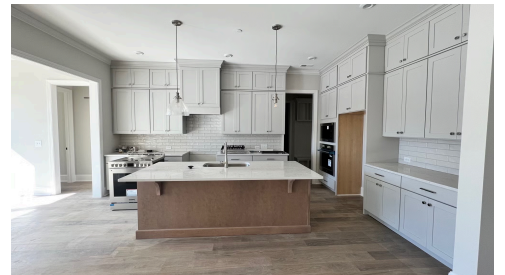
Construction Update - February 2026