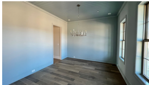
Construction Update - February 2026