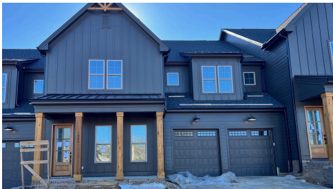
Construction Update - February 2026

Spanning two stories, this townhome embodies contemporary living with an open-concept design that seamlessly connects the family room, kitchen, and dining area. The spacious sunroom off the back of the home invites natural light and offers a delightful extension of the living space. The first floor is dedicated to comfort and luxury, featuring the owner's suite with a spacious walk-in closet, double vanities, and a standing fully tiled shower. Additional highlights on the first floor include a formal dining room, a laundry room, mudroom, and a powder room, ensuring both practicality and style. The second floor unveils a versatile rec room, a powder room for added convenience, two additional bedrooms, and a shared full bathroom. Ample storage is provided with a walk-in attic, and the townhome is complemented by an attached two-car garage.