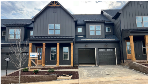
Construction Update - February 2026

Spanning two stories, this townhome embodies contemporary living with an open-concept design that seamlessly connects the family room, kitchen, and dining area. The spacious sunroom off the back of the home invites natural light and offers a delightful extension of the living space. The first floor is dedicated to comfort and luxury, featuring the owner's suite with a spacious walk-in closet, double vanities, and a standing fully tiled shower. Additional highlights on the first floor include a formal dining room, a laundry room, mudroom, and a powder room, ensuring both practicality and style. The second floor unveils a versatile rec room, a powder room for added convenience, two additional bedrooms, and a shared full bathroom. Ample storage is provided with a walk-in attic, and the townhome is complemented by an attached two-car garage.