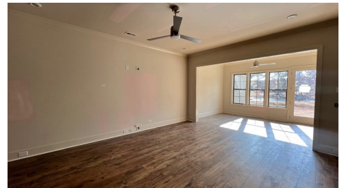
Construction Update: November 2025