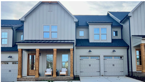
Exterior Update December 2025

Spanning two stories, this townhome embodies contemporary living with an open-concept design that seamlessly connects the family room, kitchen, and dining area. The spacious sunroom off the back of the home invites natural light and offers a delightful extension of the living space. The first floor is dedicated to comfort and luxury, featuring the owner's suite with a spacious walk-in closet, double vanities, and a standing fully tiled shower. Additional highlights on the first floor include a formal dining room, a laundry room, mudroom, and a powder room, ensuring both practicality and style. The second floor unveils a versatile rec room, a powder room for added convenience, two additional bedrooms, and a shared full bathroom. Ample storage is provided with a walk-in attic, and the townhome is complemented by an attached two-car garage.