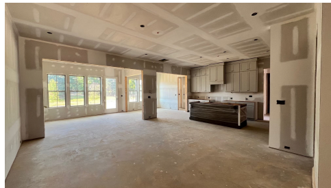
Construction Update September 2025