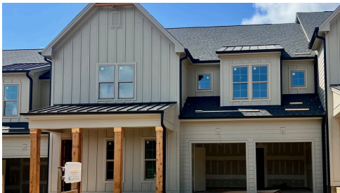
Construction Update September 2025

Spanning two stories, this townhome embodies contemporary living with an open-concept design that seamlessly connects the family room, kitchen, and dining area. The spacious sunroom off the back of the home invites natural light and offers a delightful extension of the living space. The first floor is dedicated to comfort and luxury, featuring the owner's suite with a spacious walk-in closet, double vanities, and a standing fully tiled shower. Additional highlights on the first floor include a formal dining room, a laundry room, mudroom, and a powder room, ensuring both practicality and style. The second floor unveils a versatile rec room, a powder room for added convenience, two additional bedrooms, and a shared full bathroom. Ample storage is provided with a walk-in attic, and the townhome is complemented by an attached two-car garage.