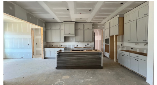
Construction Update September 2025