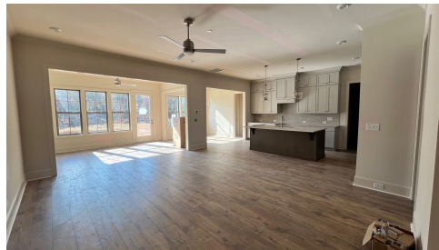
Construction Update: November 2025