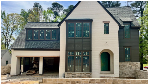
Construction Update: April 2025

This home is a blend of timeless charm and modern luxury. From its thoughtful layout to its impeccable finishes, The Augustine Plan is a rare opportunity to experience the best of North Carolina living. Schedule