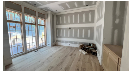
Construction Update: April 2025