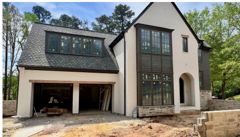
Construction Update: April 2025