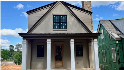
Construction Update May 2026

Homes in Pinecrest honor the architectural legacy of the area, featuring Tudor-inspired exteriors paired with refined, modern interiors. Mature trees, natural hardscapes, and curated landscaping create a setting that feels both established and inviting. Here, you can enjoy the privacy of a retreat while remaining just minutes from Durham's dining, arts, and cultural destinations, with Raleigh-Durham International Airport