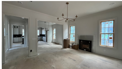
Construction Update May 2026