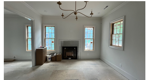
Construction Update May 2026