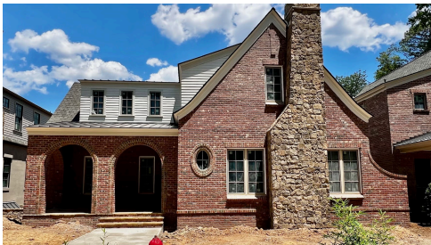
June 2026 - Exterior

Homes in Pinecrest honor the architectural legacy of the area, featuring Tudor-inspired exteriors paired with refined, modern interiors. Mature trees, natural hardscapes, and curated landscaping create a setting that feels both established and inviting. Here, you can enjoy the privacy of a retreat while remaining just minutes from Durham's dining, arts, and cultural destinations, with Raleigh-Durham International Airport