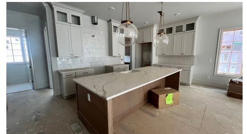
Construction Update May 2026