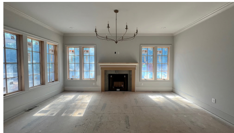
Construction Update May 2026