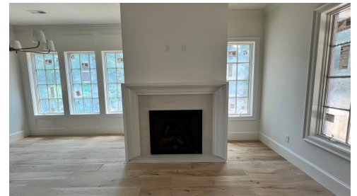
June 2026 - Family Room