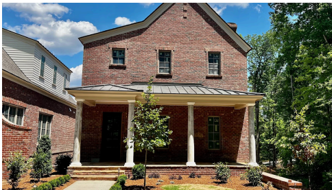
June 2026 - Exterior

Homes in Pinecrest honor the architectural legacy of the area, featuring Tudor-inspired exteriors paired with refined, modern interiors. Mature trees, natural hardscapes, and curated landscaping create a setting that feels both established and inviting. Here, you can enjoy the privacy of a retreat while remaining just minutes from Durham's dining, arts, and cultural destinations, with Raleigh-Durham International Airport