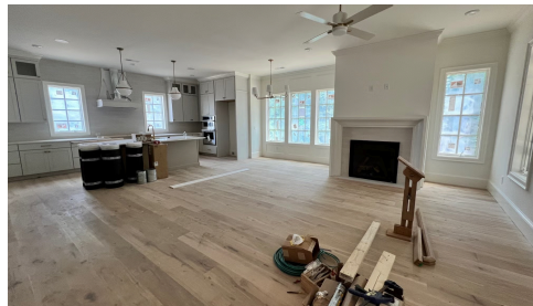
June 2026 - Family Room