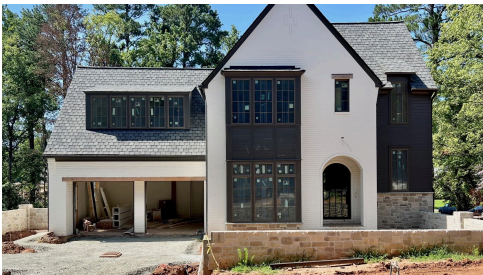
Construction Update: July 2025

This home is a blend of timeless charm and modern luxury. From its thoughtful layout to its impeccable finishes, The Augustine Plan is a rare opportunity to experience the best of North Carolina living. Schedule