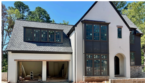
Construction Update: July 2025