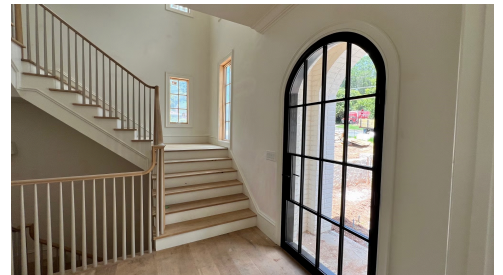
Construction Update: July 2025