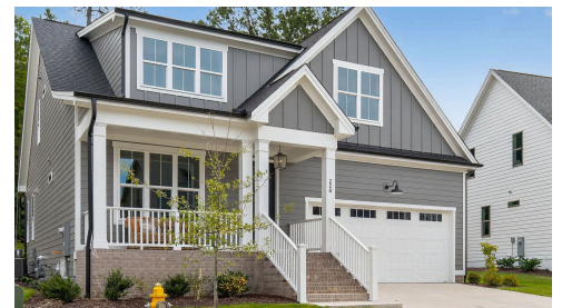
Example of completed plan