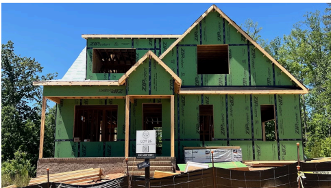
Construction Update May 2026

The Harper offers the perfect balance of modern style, thoughtful design, and everyday comfort in one stunning home. With an open layout, spacious family room, and oversized screened porch, this home was made for hosting friends, relaxing with family, and enjoying life at The View. The first-floor primary suite creates a private retreat with a spa inspired bath and generous walk-in closet, while the separate guest bedroom adds flexibility for visitors or a home office. Upstairs, the rec room and additional bedrooms provide plenty of space to spread out, play, or unwind. Designer selected finishes, rich natural tones, and elevated details bring warmth and character to every room. From quiet mornings on the front porch to evenings gathered around the kitchen island, the Harper is a home that makes every day feel special.