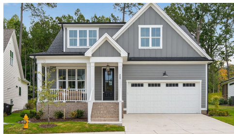
Example of completed plan