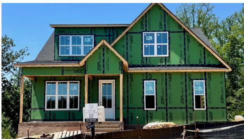
Construction Update May 2026

The Harper offers the perfect balance of modern style, thoughtful design, and everyday comfort in one stunning home. With an open layout, spacious family room, and oversized screened porch, this home was made for hosting friends, relaxing with family, and enjoying life at The View. The first-floor primary suite creates a private retreat with a spa inspired bath and generous walk-in closet, while the separate guest bedroom adds flexibility for visitors or a home office. Upstairs, the rec room and additional bedrooms provide plenty of space to spread out, play, or unwind. Designer selected finishes, rich natural tones, and elevated details bring warmth and character to every room. From quiet mornings on the front porch to evenings gathered around the kitchen island, the Harper is a home that makes every day feel special.