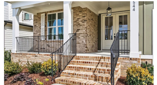
Example of completed plan Example of completed plan