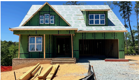
Construction Update May 2026

The Concord is where timeless charm meets modern living in the heart of North Durham. This thoughtfully designed home welcomes you with an open layout, soaring natural light, and stylish designer finishes that feel both warm and elevated. The stunning kitchen with beautifully curated details and a spacious island is ready for everything from quiet mornings to lively gatherings. A luxurious first floor primary suite offers the perfect retreat, while the upstairs rec room and private guest suite create space for everyone to spread out and relax. Enjoy evenings on the screened porch overlooking The View's beautiful community setting. With flexible living spaces and effortless style throughout, the Concord is a home that truly has it all.