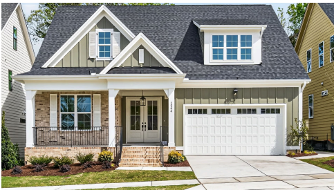
Example of completed plan

The Concord is where timeless charm meets modern living in the heart of North Durham. This thoughtfully designed home welcomes you with an open layout, soaring natural light, and stylish designer finishes that feel both warm and elevated. The stunning kitchen with beautifully curated details and a spacious island is ready for everything from quiet mornings to lively gatherings. A luxurious first floor primary suite offers the perfect retreat, while the upstairs rec room and private guest suite create space for everyone to spread out and relax. Enjoy evenings on the screened porch overlooking The View's beautiful community setting. With flexible living spaces and effortless style throughout, the Concord is a home that truly has it all.