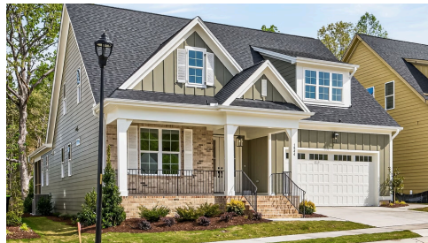
Example of completed plan