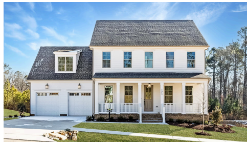
Example of completed plan