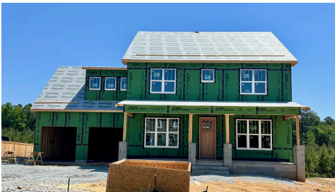
Construction Update May 2026

The Azalea Craftsman delivers the perfect mix of classic curb appeal and beautifully designed living spaces. From the expansive front porch to the open family room and oversized screened porch, this home was made for gathering, entertaining, and enjoying every season. The spacious kitchen flows effortlessly into the breakfast nook and family room, creating a warm and welcoming heart of the home. Upstairs, the private owner's suite feels like a retreat with a spa inspired bath, generous walk in closet, and convenient laundry access nearby. Flexible spaces like the first-floor study and bonus rec room give you plenty of room to work, relax, or host guests with ease. Thoughtfully selected finishes and timeless Craftsman details bring style and comfort together in every corner of this stunning home.