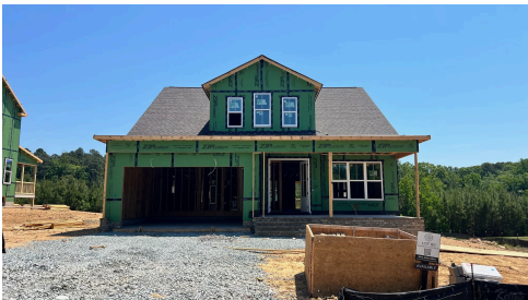
Construction Update May 2026

The Mayfair Lowcountry blends classic Southern charm with spacious modern living in one unforgettable home. From the welcoming front porch to the airy open concept design, every detail was made for easy everyday living and effortless entertaining. The first floor owner's suite creates a private retreat, while the upstairs rec room, additional bedrooms, and unfinished storage offer room to grow for years to come. Designer inspired finishes, warm natural tones, and beautiful lighting selections bring character and comfort to every space. The screened porch is the perfect spot for slow mornings, game day gatherings, or relaxing evenings under the Carolina sky. With its flexible layout and timeless style, the Mayfair Lowcountry feels like home from the moment you walk in.