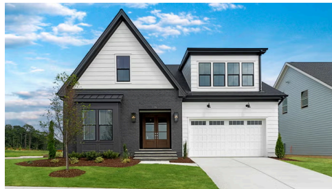
Example of completed plan