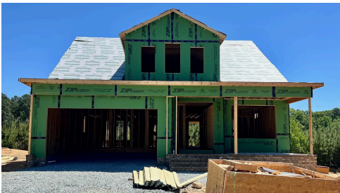
Construction Update May 2026

The Mayfair Lowcountry blends classic Southern charm with spacious modern living in one unforgettable home. From the welcoming front porch to the airy open concept design, every detail was made for easy everyday living and effortless entertaining. The first floor owner's suite creates a private retreat, while the upstairs rec room, additional bedrooms, and unfinished storage offer room to grow for years to come. Designer inspired finishes, warm natural tones, and beautiful lighting selections bring character and comfort to every space. The screened porch is the perfect spot for slow mornings, game day gatherings, or relaxing evenings under the Carolina sky. With its flexible layout and timeless style, the Mayfair Lowcountry feels like home from the moment you walk in.