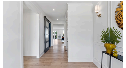
Example of completed plan