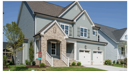
Example of completed Fairfield plan