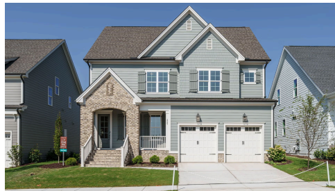
Example of completed Fairfield plan