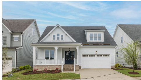
Example of completed Concord plan