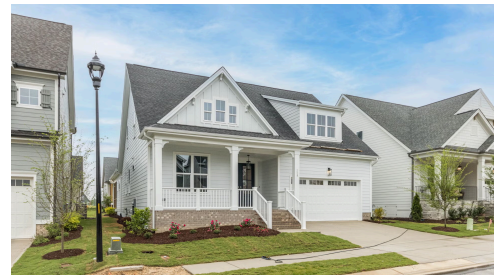
Example of completed Concord plan