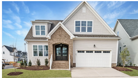
Example of completed Mayfair plan