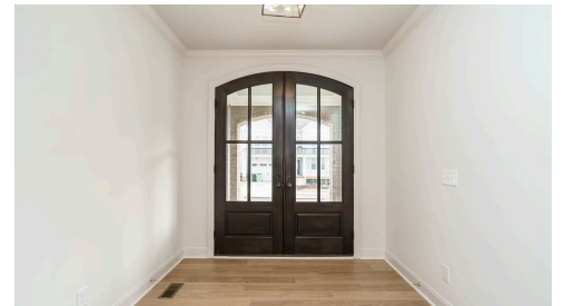
Example of completed Mayfair plan