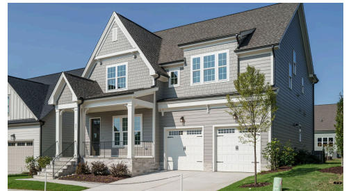
Example of completed Bristol plan