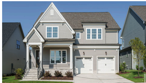
Example of completed Bristol plan