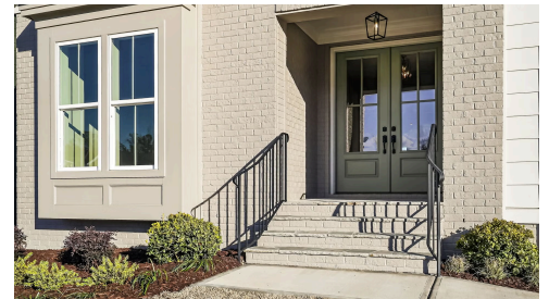
Example of completed plan