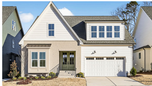
Example of completed plan