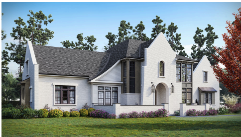
Exterior Rendering Front

The first-floor primary suite offers an impressive 11-foot ceiling and a well equipped en suite with a Kohler freestanding soaking tub, zero entry rain shower, heated Calcutta Oro tile floors, Kohler Anthem digital shower system, Kohler smart toilet, and custom designed closet. A first-floor guest suite provides flexibility for visiting guests or multigenerational living. Upstairs, a coffered recreation room with Sonos 5.1 surround