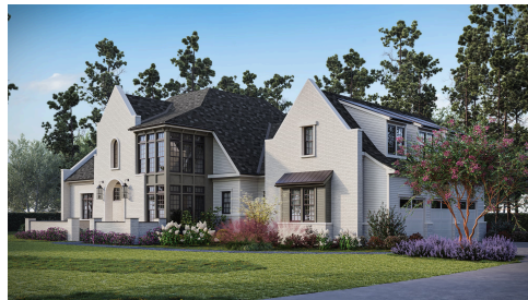
Exterior Rendering Side