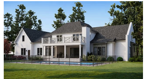
Exterior Rendering Rear