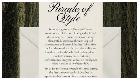
Parade of Style Inspiration