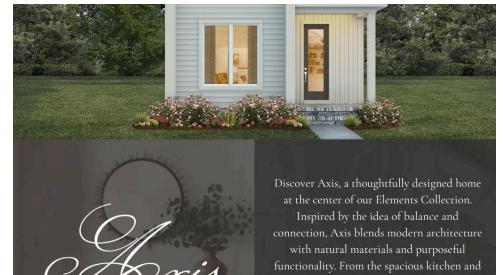
Parade of Style Inspiration