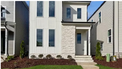
Construction Update October 2025

The Terra C plan at homesite 4627 features a detached garage and a thoughtfully designed layout. The kitchen, dining area, family room, and powder room are all conveniently located downstairs, while the primary suite and additional bedrooms are upstairs. This home showcases the Copper design package from The Elements Collection in Chatham Park. Each collection has been carefully curated by our award-winning design team to create a cohesive and timeless aesthetic. With The Elements Collection, you can be confident that your home will be both beautifully designed and tailored to your lifestyle.