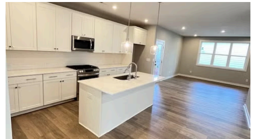
Construction Update October 2025