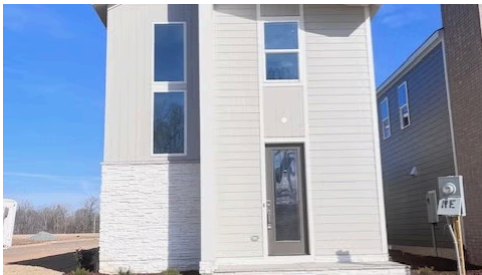
Construction Update - February 2026

Lock in a 30-Year Fixed Rate at 1% Below Today's Average! With the use of our preferred lender and attorney, you can secure financing at a rate one percent lower than the daily average. No hassle. No gimmicks. Just a straightforward opportunity designed to give you peace of mind, confidence, and long-term security as you take the next step toward your new home.