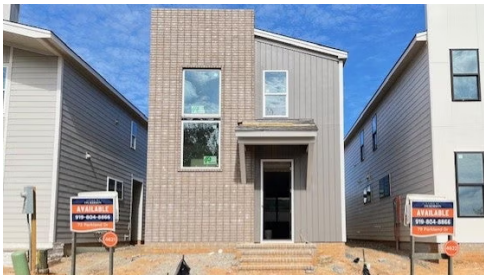
Construction Update October 2025

Lock in a 30-Year Fixed Rate at 1% Below Today's Average! With the use of our preferred lender and attorney, you can secure financing at a rate one percent lower than the daily average. No hassle. No gimmicks. Just a straightforward opportunity designed to give you peace of mind, confidence, and long-term security as you take the next step toward your new home.