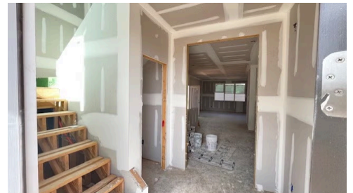
Construction Update October 2025