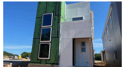
Construction Update: May 2025