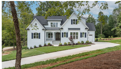
Example of completed Brighton