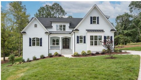
Example of completed Brighton

Experience the perfect blend of craftsmanship, comfort, and community in this custom new construction home located in the desirable Corbett Landing neighborhood. Situated on a spacious 1-acre lot, this thoughtfully designed residence offers both elegance and functionality, with premium features and custom finishes throughout. The main level includes a private owner's suite and a dedicated study, ideal for working from home. An oversized 3 car garage. The heart of the home features a vaulted kitchen and dining area, complete with exposed beams and clerestory windows that flood the space with natural light. The family room centers around a cozy fireplace, while the screened porch with a second fireplace creates the perfect space for year-round outdoor living. Upstairs, you'll find three additional bedrooms, each with access to a full bathroom, plus a spacious rec room offering flexible living space for media, play, or entertaining. Located in Corbett Landing, a premier community with access to a neighborhood pool, clubhouse, and fitness area, this home offers the ideal combination of privacy and amenities. Currently under construction and projected to be move in ready by early 2026, this is your opportunity to secure a one-of-a-kind home in a scenic, amenity rich setting. Photos are of previously built Brighton floorplan.