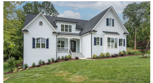
Example of completed Brighton