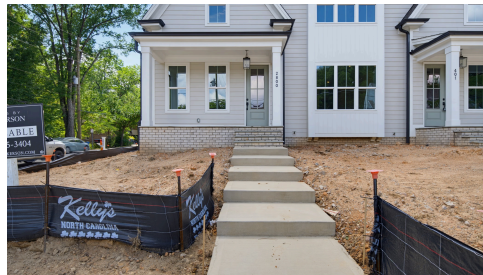
Construction Update June 2026