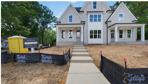
Construction Update June 2026

Designed for modern living, this thoughtfully crafted three-story home offers the perfect balance of open gathering spaces and private retreats. The main level features a bright, open-concept layout with a spacious kitchen, dining area, family room, powder room, and rear patio designed for everyday living and effortless entertaining. Upstairs, the private owner's suite includes a generous walk-in closet and spa-inspired bath, alongside two additional bedrooms, a full bath, and convenient laundry room. The third floor provides exceptional flexibility with a fourth bedroom and full bath. Designer-selected finishes create a light and inviting aesthetic throughout the home. Every detail has been carefully chosen to deliver both style and functionality. Beyond the front door, one of Raleigh's most vibrant and connected neighborhoods awaits. From grabbing coffee on Hillsborough Street to cheering on the Wolfpack just minutes from home, this location puts you at the center of the energy, tradition, and excitement that make Raleigh so special.