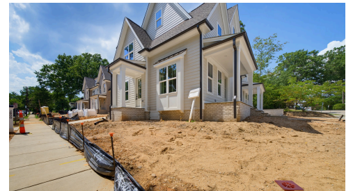
Construction Update June 2026