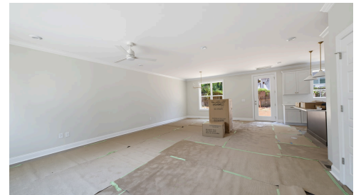
Construction Update June 2026