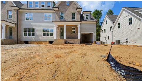
Construction Update June 2026

Designed for modern living, this thoughtfully crafted three-story home offers the perfect balance of open gathering spaces and private retreats. The main level features a bright, open-concept layout with a spacious kitchen, dining area, family room, powder room, and rear patio for effortless entertaining. Upstairs, the private owner's suite includes a generous walk-in closet and spa-inspired bath, alongside two additional bedrooms, a full bath, and convenient laundry room. The third floor provides exceptional flexibility with a fourth bedroom, full bath, loft, and additional storage space. Curated designer selections bring timeless style and elevated finishes throughout the home. Every detail has been carefully chosen to create a space that feels both sophisticated and welcoming. Beyond the front door, one of Raleigh's most vibrant and connected neighborhoods awaits. From grabbing coffee on Hillsborough Street to cheering on the Wolfpack just minutes from home, this location puts you at the center of the energy, tradition, and excitement that make Raleigh so special.