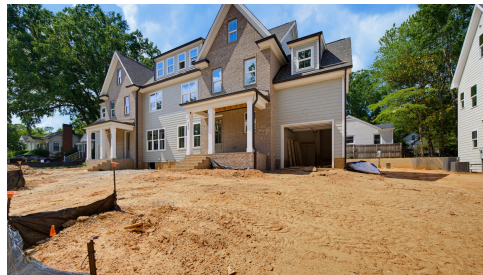
Construction Update June 2026