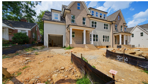
Construction Update June 2026