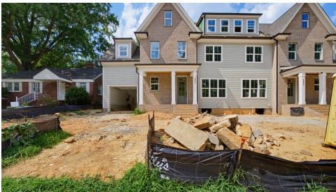
Construction Update June 2026

Designed for modern living, this thoughtfully crafted three-story home offers the perfect balance of open gathering spaces and private retreats. The main level features a bright, open-concept layout with a spacious kitchen, dining area, family room, powder room, and rear patio for effortless entertaining. Upstairs, the private owner's suite includes a generous walk-in closet and spa-inspired bath, alongside two additional bedrooms, a full bath, and convenient laundry room. The third floor provides exceptional flexibility with a fourth bedroom, full bath, loft, and additional storage space. Curated designer selections bring timeless style and elevated finishes throughout the home. Every detail has been carefully chosen to create a space that feels both sophisticated and welcoming. Beyond the front door, one of Raleigh's most vibrant and connected neighborhoods awaits. From grabbing coffee on Hillsborough Street to cheering on the Wolfpack just minutes from home, this location puts you at the center of the energy, tradition, and excitement that make Raleigh so special.