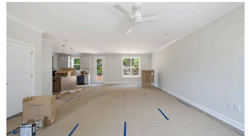
Construction Update June 2026