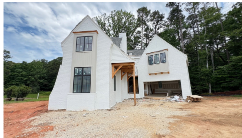
Construction Update: June 2025