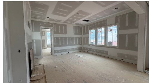
Construction Update: June 2025