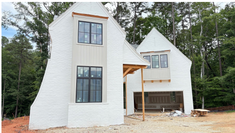
Construction Update: June 2025

Step into refined living with this custom-built Adeline plan—a stunning new construction home offering 4 bedrooms, 5.5 bathrooms, and over 3,500 square feet of expertly designed space. Nestled on a beautifully wooded .32-acre lot, this home combines privacy with walkable access to shopping, dining, and the serene Laurel Hills Park. The thoughtful layout includes a main-floor guest suite with private bath, a spacious owner's retreat on the second level, and a third-floor rec room complete with a wet bar—perfect for entertaining. Enjoy the dramatic vaulted ceilings in the bonus room over the garage, adding architectural interest and dimension. Every inch of this home is crafted with high-end custom finishes and features, from the chef's kitchen to the luxurious baths. Whether you're relaxing indoors or enjoying the natural beauty of the lot, this home offers a lifestyle of comfort and convenience.