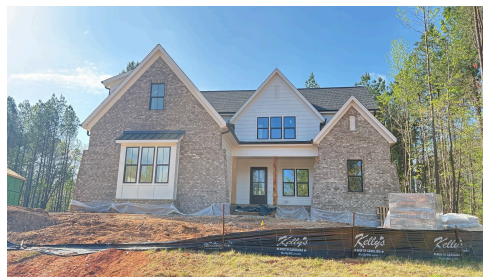
Construction Update: April 2026