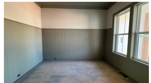
Construction Update: April 2026