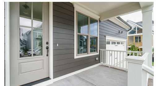
Completed Burlington Plan