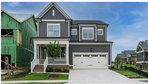
Completed Burlington Plan

Life at Wendell Falls offers more than just a beautiful home. Residents enjoy two resort-style pools (one just a short stroll away), a 24-hour fitness center, over 10 miles of scenic trails, and numerous parks and playgrounds. Just minutes away, Treelight Square provides everyday conveniences, boutique shopping,