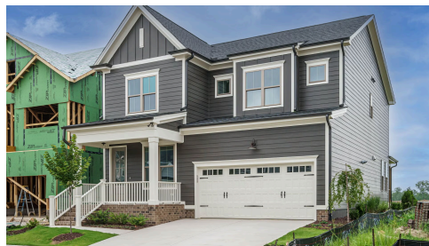
Completed Burlington Plan