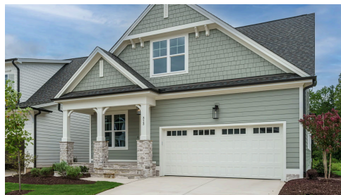
Example of completed Rosemary Craftsman