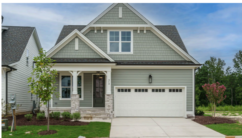
Example of completed Rosemary Craftsman

Life at Wendell Falls offers more than just a beautiful home. Residents enjoy two resort-style pools (one just a short stroll away), a 24-hour fitness center, over 10 miles of scenic trails, and numerous parks and playgrounds. Just minutes away, Treelight Square provides everyday conveniences, boutique shopping,