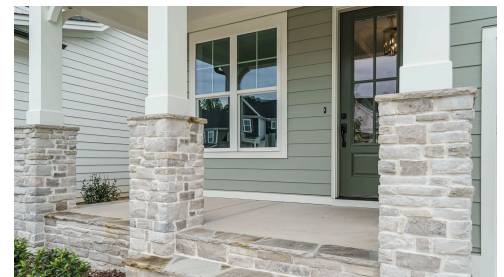
Example of completed Rosemary Craftsman