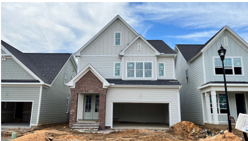
Construction Update June 2026

Enjoy all the incredible amenities of Wendell Falls which include two pools, a 24-hour fitness center, over 10 miles of trails, several parks, and playgrounds. Super convenient quick drive to Treelight Square with Publix, boutique shops, services, and dining options that will please everyone. You are going to LOVE it