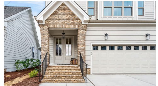
Example of completed Meadowmont Tudor