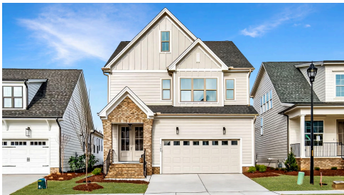
Example of completed Meadowmont Tudor

Enjoy all the incredible amenities of Wendell Falls which include two pools, a 24-hour fitness center, over 10 miles of trails, several parks, and playgrounds. Super convenient quick drive to Treelight Square with Publix, boutique shops, services, and dining options that will please everyone. You are going to LOVE it