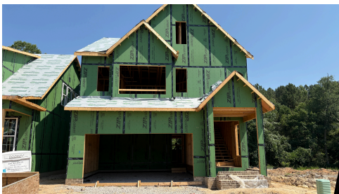
Construction Update June 2026

Enjoy all the incredible amenities of Wendell Falls which include two pools, a 24-hour fitness center, over 10