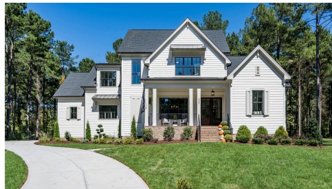
Completed Home Example