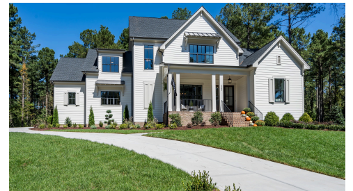
Completed Home Example