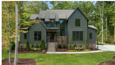
Example of completed home