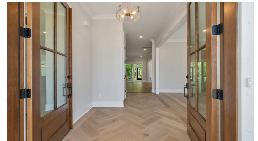
Example of completed plan