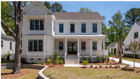
Example of completed plan

Experience elevated lowcountry living with the Drayton's charming farmhouse exterior and welcoming covered front porch. Step inside to discover a beautifully designed space featuring a luxurious first-floor primary suite with spa-like bath, dual vanities, soaking tub, a spacious walk-in closet, plus an open-concept layout perfect for entertaining. Upstairs, you'll find three additional bedrooms (two with ensuite baths), a versatile loft, and an expansive recreation room, ideal for growing families or those who love to host. With thoughtful touches like a screened porch for relaxing evenings, convenient mudroom and laundry room, and abundant storage throughout, the Drayton plan offers the perfect blend of southern elegance and modern functionality. Don't miss this opportunity to call Mount Pleasant home!