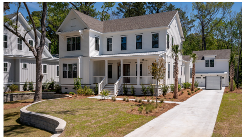
Example of completed plan