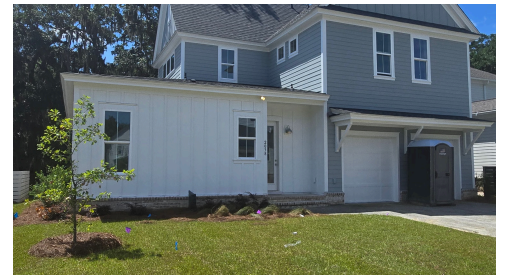
Construction Update: July 2025