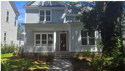
Construction Update: July 2025

This stunning Coosaw plan features 4 bedrooms, 3.5 baths, and a spacious upstairs loft, offering flexibility for work, play, or relaxation. Thoughtful craftsmanship is evident throughout, with elevated trim details, designer-selected fixtures, and custom touches that bring a sense of upscale charm to every room. Enjoy exclusive community amenities including historic ruins, a waterfront park, deep water dock, pool, and play area—all just steps from your front door.