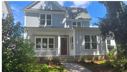
Construction Update: July 2025