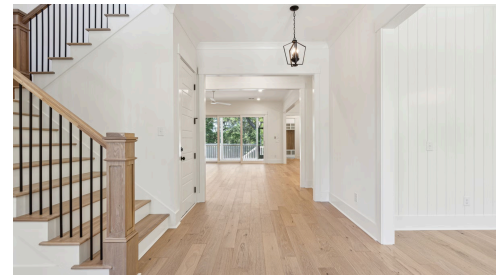
Example of completed plan