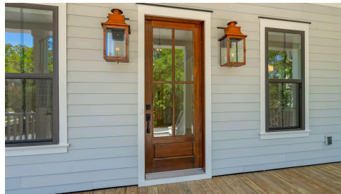
Example of completed plan