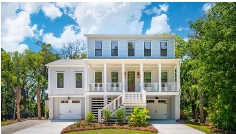
Example of completed plan

Welcome to the Georgetown plan. A stunning elevated 4-bedroom, 4.5-bath home that perfectly captures the charm and elegance of Lowcountry living. The main level delivers an impressive open layout with a soaring family room, dedicated dining room, and well-appointed kitchen, all designed for effortless entertaining. A first-floor primary suite offers a true private retreat, complete with a spa-inspired bath, walk-in closet, and direct access to the screened porch. Step outside to enjoy multiple outdoor living spaces, including a covered front porch, screened rear porch, and a covered second-floor balcony with sweeping views. Upstairs, three additional bedrooms, a loft, and a flexible bedroom/rec room option provide all the space your family needs to grow and thrive. Thoughtful details like a mudroom, dedicated laundry, elevator, and bar area reflect the elevated level of livability this home delivers. The Georgetown plan is the perfect blend of sophisticated design and relaxed Lowcountry lifestyle - contact us today to learn more.