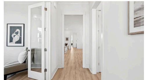
Example of finished plan