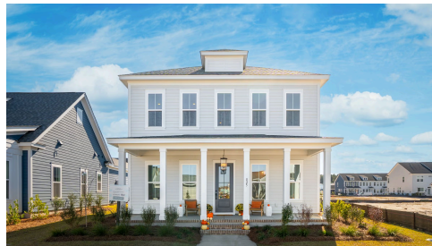
Example of finished plan